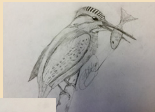
Kingfisher drawn by Sohail Khan