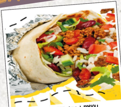
NEW street food menu. TASTY handheld snacks such as burritos, noodles and rice dishes throughout the week!