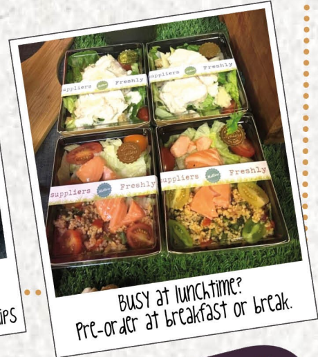
BUSY at lunchtime? Pre-order at breakfast or break.