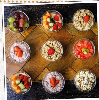
NEW breakfast & break snacks to help you fuel up before school.