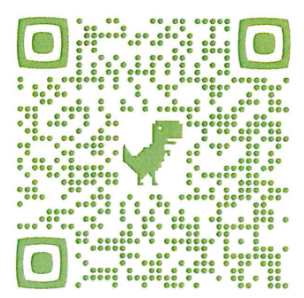
Scan the QR with your phone camera to open the crowdfunding link

www.spacehive.com/create-dragon-pond-at-jo-cox-wood