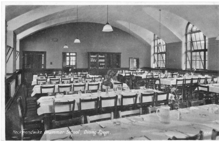
Heckmondwike Grammar School, Dining Room.