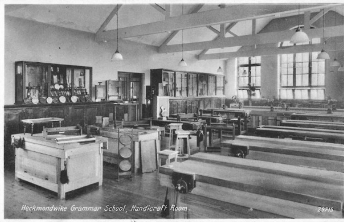
Heckmondwike Grammar School, Handicraft Room.