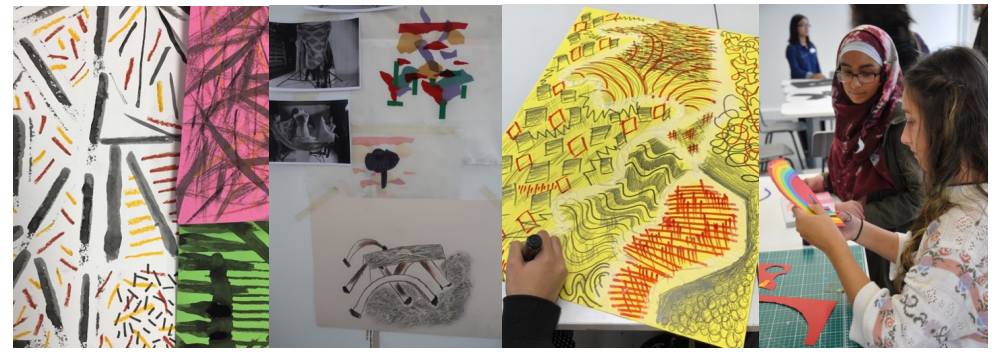
Thursday 13th May - Thursday 24th June 2021 Released at 12 noon every week

There will be 1 week break for the half term on Thursday 3rd June.