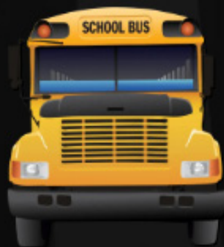
Yr 10 Music & Drama Students - Leeds Grand