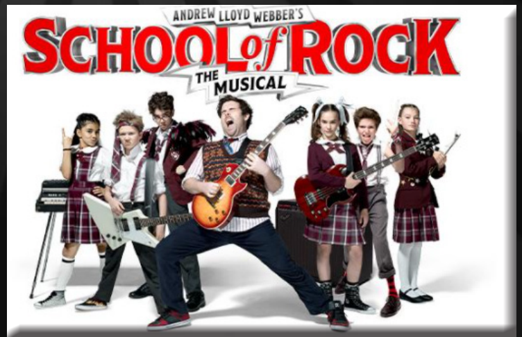
Yr 12 - London Business Tri p February 2023