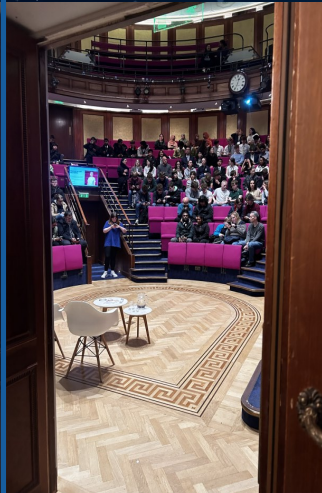
The lecture theatre