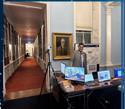
The stand at the Royal Institution