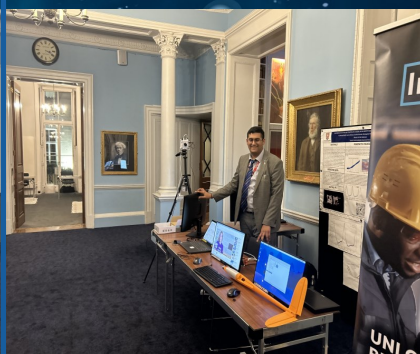
The stand at the Royal Institution